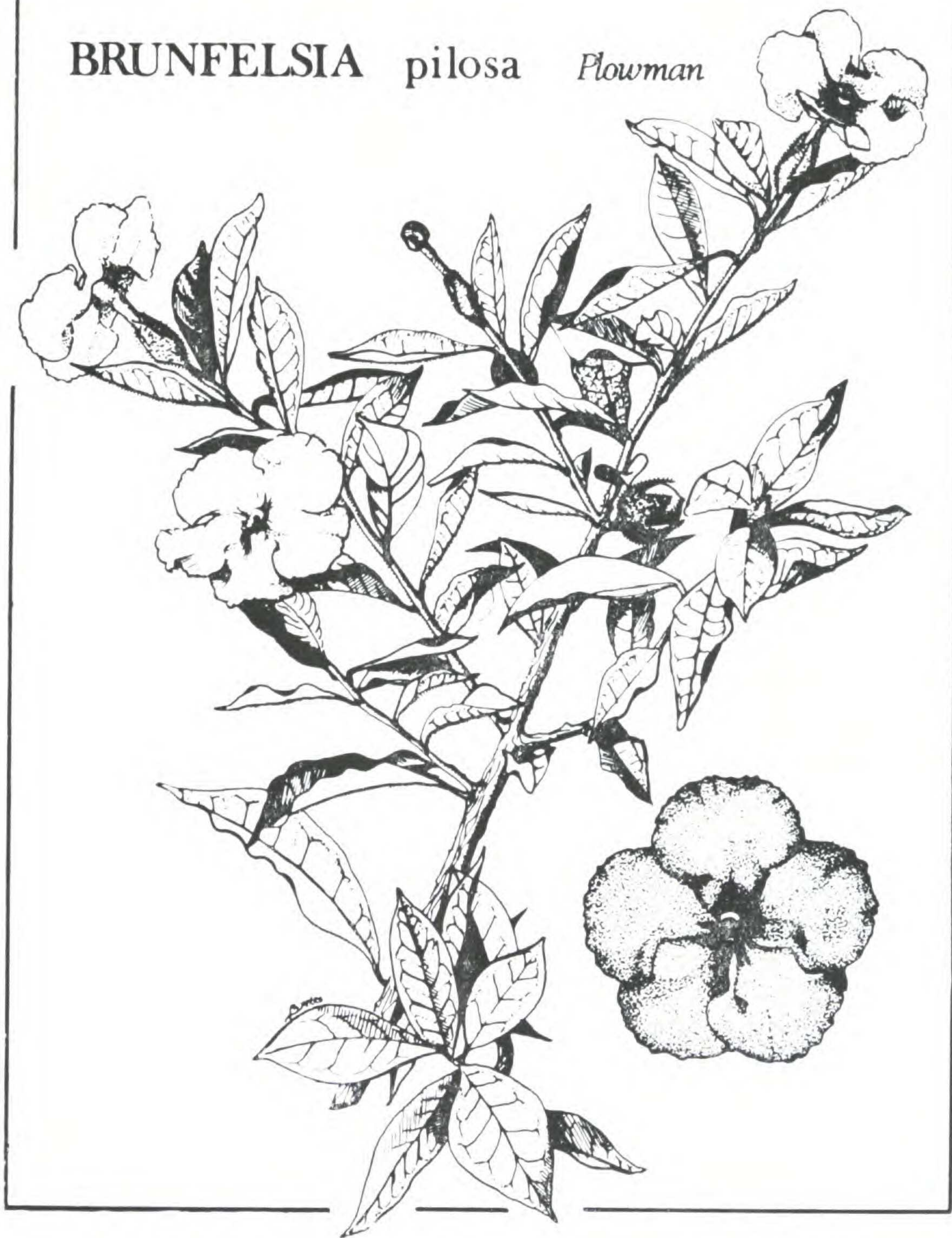
Brunfelsia pilosa Plowman. 1, flowering and fruiting branch, one-half natural size. 2, corolla limb from above, approximately natural size. Drawn from living plant in cultivation at Miami, Florida, Plowman 2963 (ECON).